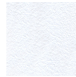
White Textured Paint (WT)