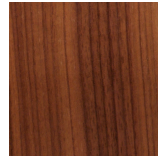
Natural Walnut (W)