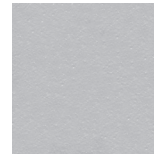
Grey Textured (GT)