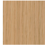
Natural White Oak (12)