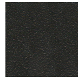
Black Textured Paint (BT)