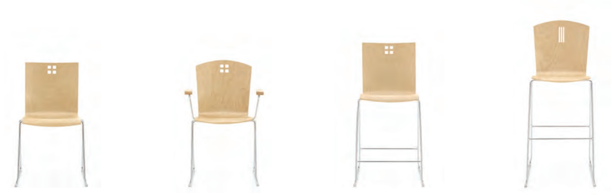
Side Chair w 19¾ d 21 h 34 sh 18½