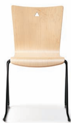
Little Marquette chair crescent shell, triangle cut-out.