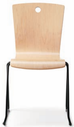
Little Marquette chair arc shell, circle cut-out.

Design: Seating, Leland Design Group; table, 2B Studio