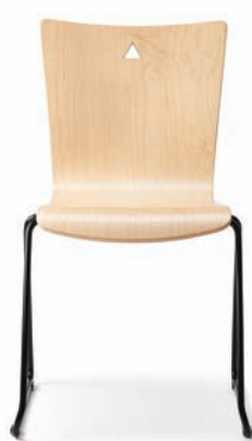
Little Marquette chair crescent shell, triangle cut-out.