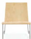
Lounge Chair Low Back w 25¼ d 31 h 37 sh 14½