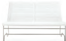
Settee Low Back w 79½ d 31 h 37 sh 15½