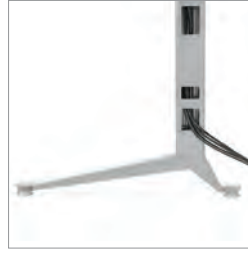
C Base Leg with Wire Management