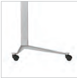
C Base Leg with Casters