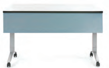
T Base with Modesty Panel