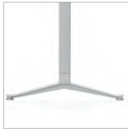
T Base Leg with Glides