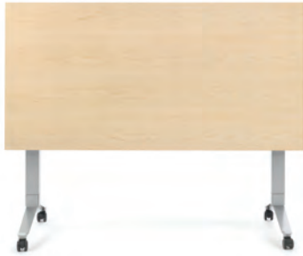
T Base Flip Top