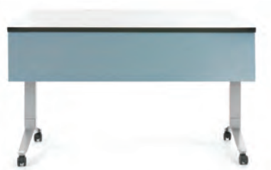
T Base with Modesty Panel