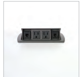
Power Module Detail