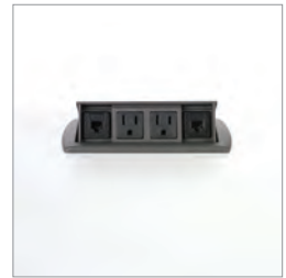
Power Module Detail